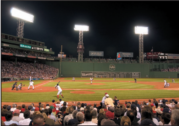
Fenway Park, home to the Boston Red Sox since 1912.

Sea Foods locations. And to satisfy a sweet tooth, don't miss the Chocolate Bar at Café Fleuri in the Langham Hotel.