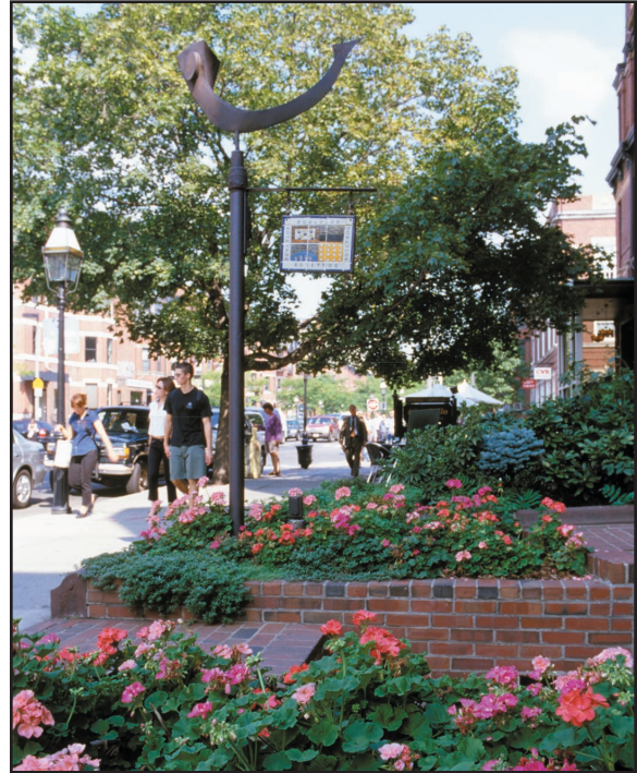
Shops, galleries, and restaurants line Newbury Street in the Back Bay.

Weather permitting, the Boston area has some classic golf layouts worth exploring. Outstanding public tracks include the Braintree Municipal Golf Course , Brookmeadow Country Club in Canton, George Wright Golf Course in Hyde Park, Newton Commonwealth Golf Course , Pinehills Golf Club in Plymouth, Shaker Hills Golf Course in Harvard, and William J. Devine Franklin Park Golf Course near downtown Boston.