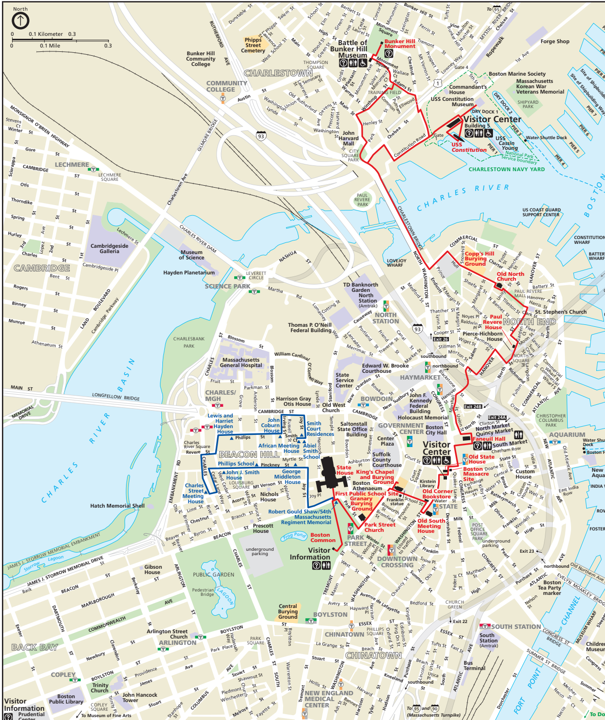
Continuous red line represents the Freedom Trail.