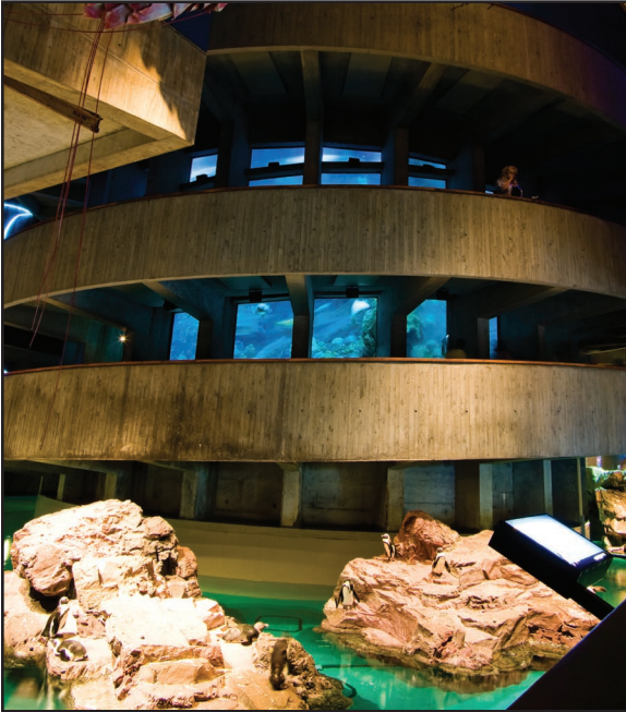
The Giant Ocean Tank, a four-story coral reef exhibit, impresses visitors at the New England Aquarium.

Archaeology and History of the Indian College and Student Life at Colonial Harvard”. Finally, the pass provides admission to the Skywalk Observatory atop the Prudential Center, along with an audio tour.